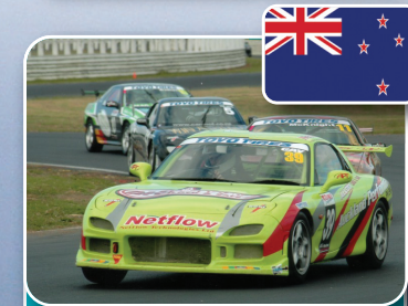
National Mazda Pro7 Racing Series