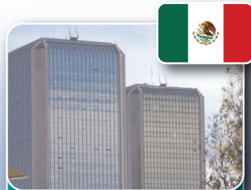
Grand Hotel Tijuana