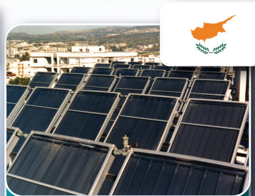
Cypria Maris Hotel